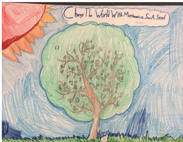
Kaden Childers Grade 3 Cowpens Elementary School Spartanburg District #3